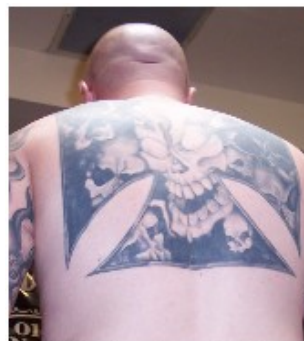
"Buff" showing off his 'better side.'

The Bizarre Bazaar® shows are unique marketplaces featuring hundreds of exclusive exhibitors selected from the best craft and gift shows in America. The shows attract thousands of enthusiastic shoppers from Virginia and the surrounding Southeastern states.