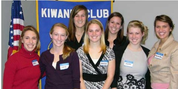
Thomas Dale High School Keyette Club Adviser and Officers

Kiwanis, through guidance and example, works to develop future generations of leaders.