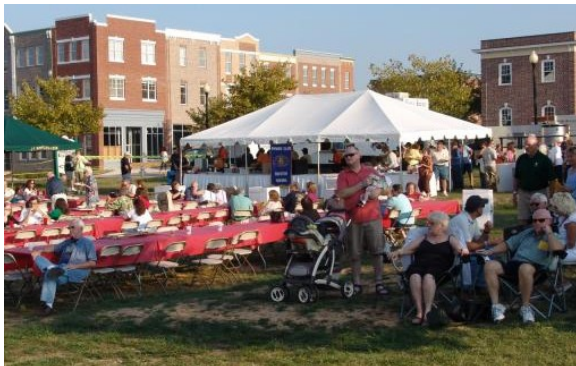
2008 Fall "Hard Times" Festival